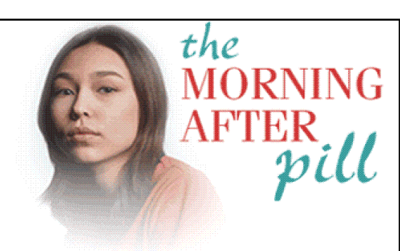
what you need to know about emergency contraception

COMMENT: People fall into error when they follow the teachings of misguided men, instead of God's Word -- the Bible.